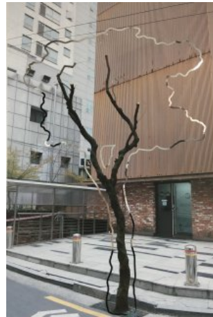
GLENN WEXLER The Tree #21 (Los Angeles), 2022 Digital photo 21 x 15 x 1.5 in (h x w x d)